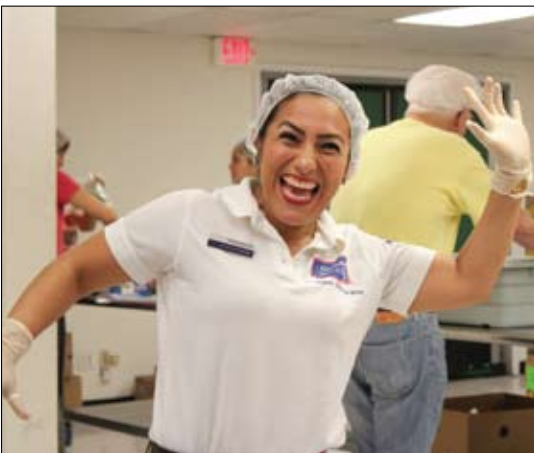
Hampton Inn & Suites