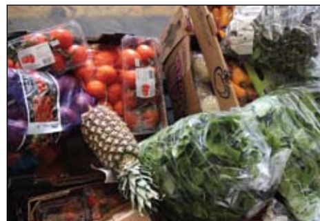
"Rescued" fresh food moves quickly from retail stores to the Food Bank warehouse to agencies.

As little as 2 percent of rescued food is found to be unfit for human consumption,