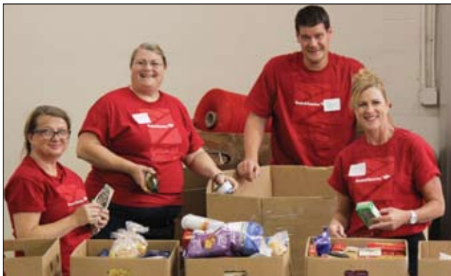
Bank of America employees recently teamed up to package food for Harry Chapin Food Bank partner agencies.