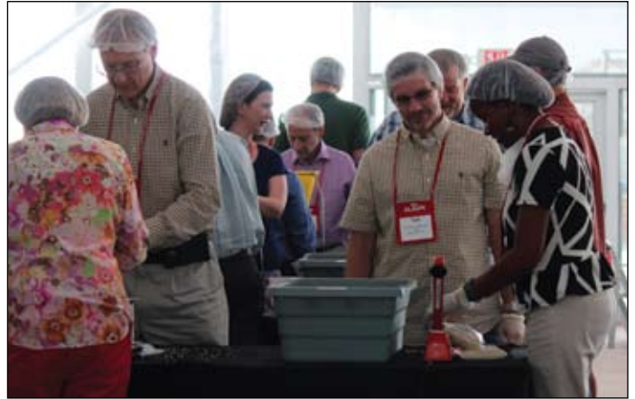
Marco Island Marriott