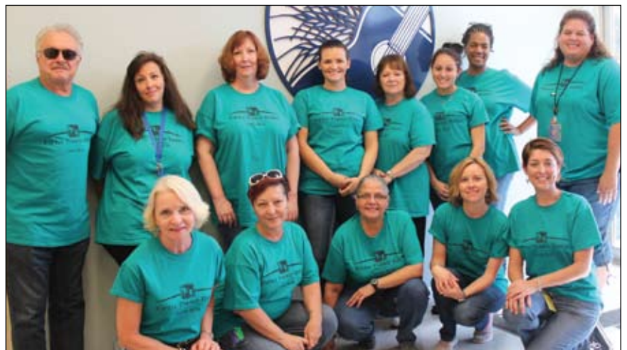
Fifth Third Bank