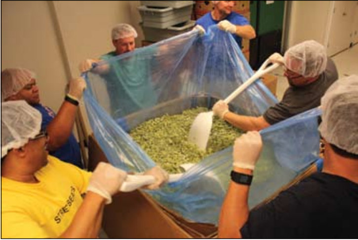
Frozen Green Beans at Soma/Chico's

Find more photos at harrychapinfoodbank.org