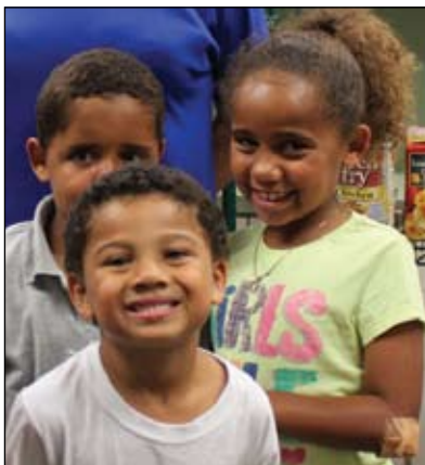
Baker Center food pantry gets nutritious food to children and families it serves.

The pantry also helps parents who come in for food assistance become more involved with teachers and school activities. When registering parents for food assistance on pantry days, school staff identifies other areas of need and connects families with community resources on employment, housing and medical care.