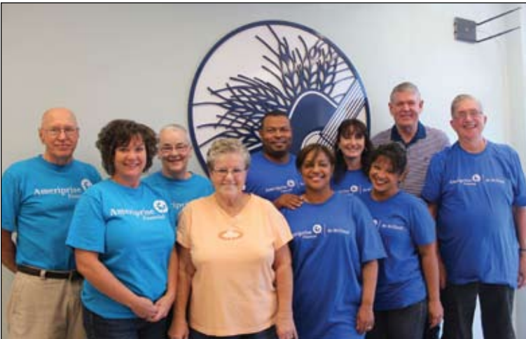
Ameriprise Day of Service