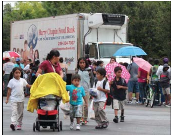
Parkside Elementary Mobile Pantry Distribution