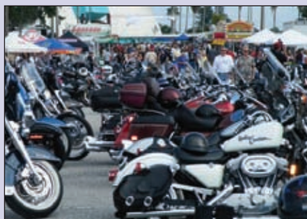
The Florida Hot Rods & Hogs car and bike show at the Lee Civic Center lowered its admission fee for anyone donating non-perishable food items to the Food Bank.