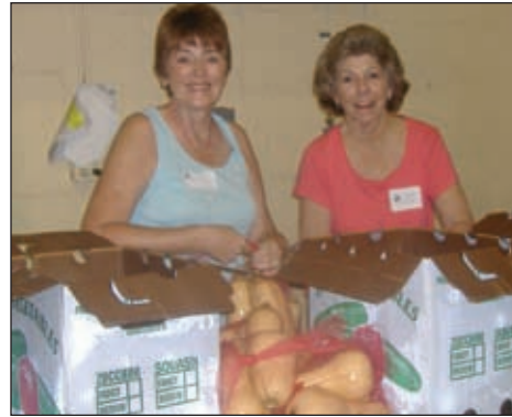
Four Lutheran churches delivered 717 hours of volunteer service to the Food Bank in August.