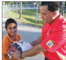
Mobile pantries distributed turkeys to families in need at holiday time.

...And to the exceptional Marriott volunteers, whose hard work at the mobile pantry distribution comes through the hotel's "Spirit to Serve" program.