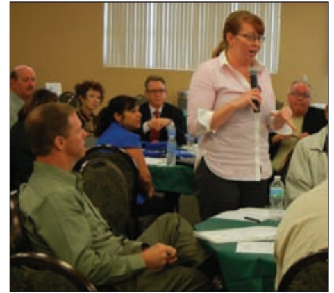
Senior Hunger Summit participants worked in groups to prioritize future community actions.