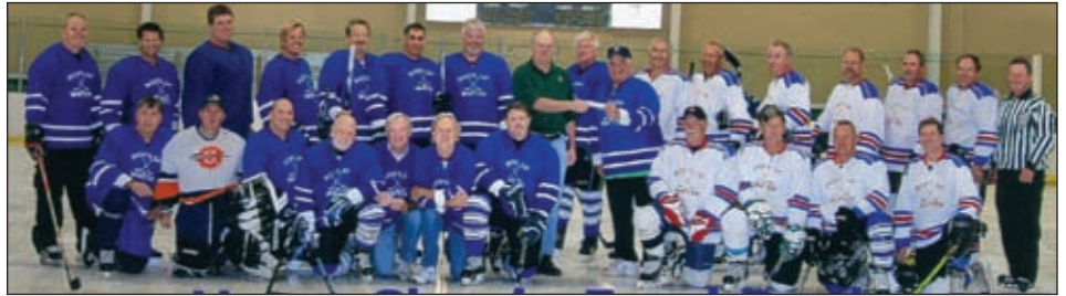
The Boys of Winter hockey team of over-50-year-olds had fun raising $1,500 for the Food Bank during their games at the Skatium in Fort Myers.