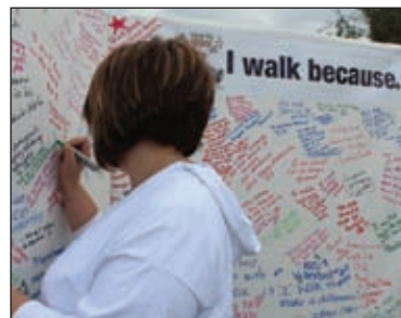
Hunger Walk participants share stories on "I walk because..." signs.