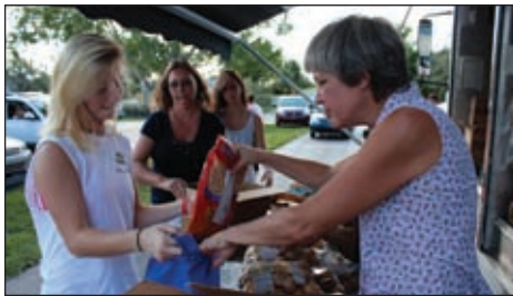
A mobile pantry distribution took place at Golden Gate Elementary School in Collier County.