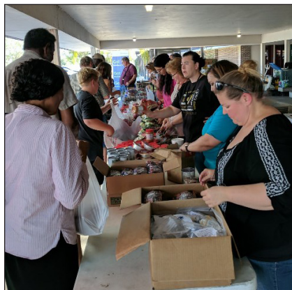
A busy mobile pantry in Moore Haven