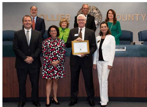
We were named Collier County Business of the Month for March by the Collier County Commission and the Greater Naples Chamber of Commerce.