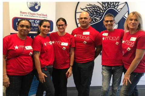
Macy's staff members volunteered at our Fort Myers Distribution Center.