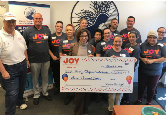
Local managers from Dunkin' delivered a $3,000 check from Dunkin's Joy in Childhood Foundation.