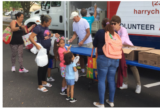
We distributed 20,856 pounds of food to families at mobile pantries while Lee County schools were on spring break.