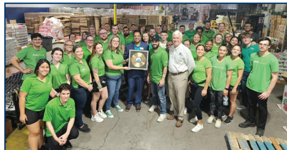
Publix Plaque Presentation at the Fort Myers Warehouse