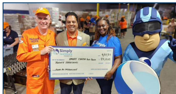
Simply Healthcare Presenting HCFCB with a $20,000 Gift